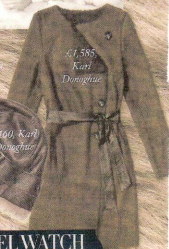
£1,585, Karl Donoghue